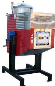
Si/Di120A 120 litre