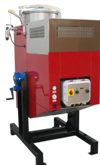
Si/Di160A 160 litre

The Standard Distatic models are available in non-flammable (S series) and flammable (D series ATEX Certified) versions with copper or stainless steel condensers. The standard distillers use air cooled condensers but water cooled versions are available as a no cost option in most cases.