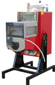
Si/Di60A 60 litre