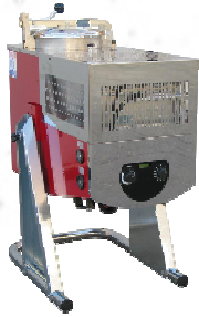
Si/Di30A 30 litre